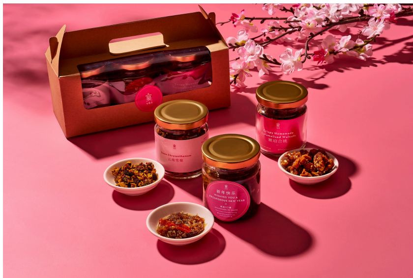
Bundle of Three Mini Fortunes Gift Box (XO Spicy Sauce, Snow Chrysanthemum Tea, Caramelised Walnuts) 迷你礼品盒 (宴极品XO酱, 雪菊, 琥珀核桃)