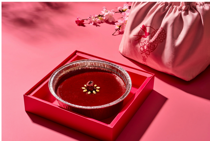
Prosperity Nian Gao with Pink Satin Bag 团圆年糕礼袋